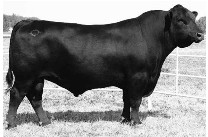
MYTTY IN FOCUS

A daughter of the very popular EXAR Upshot 0562B out of a female sired by S A V 004 Predominant 4438 who serves in the Accelerated Genetics stud. A nice open heifer from the embryo program at Powell Farm. Outstanding EPD's on this open heifer. Her $B is +135.35.