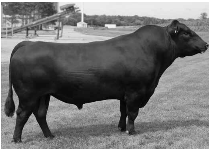
PA SAFEGUARD 021