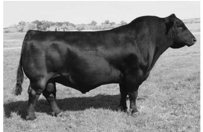
SITZ WISDOM 481T