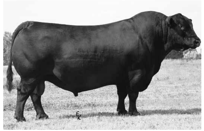
S A V FINAL ANSWER 0035