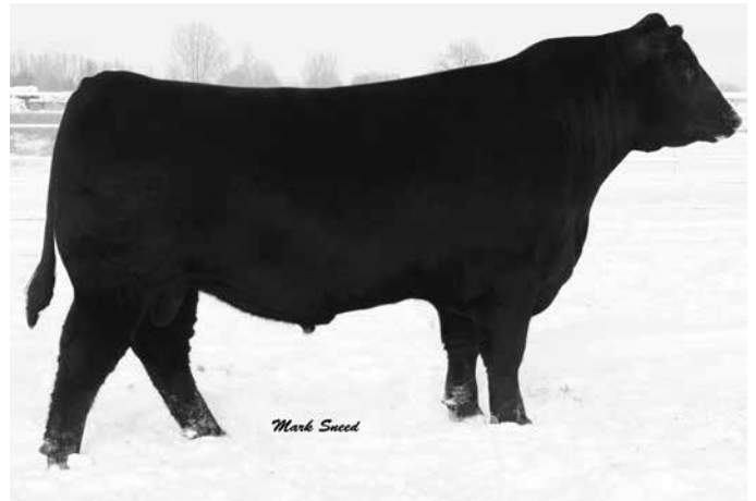
TC ABERDEEN 759

L25 has an actual birth weight of 70 lbs., a 205 day adjusted weaning weight of 649 lbs., a 365 day adjusted yearling weight of 967 lbs. and a yearling frame score of 5.7. She is sired by the Genex bull Mohnen Impressive 1093 whose EPD's are -1.4 +62 +106 +21 and $B +103.66. Calfhod vaccinated. Sells open.