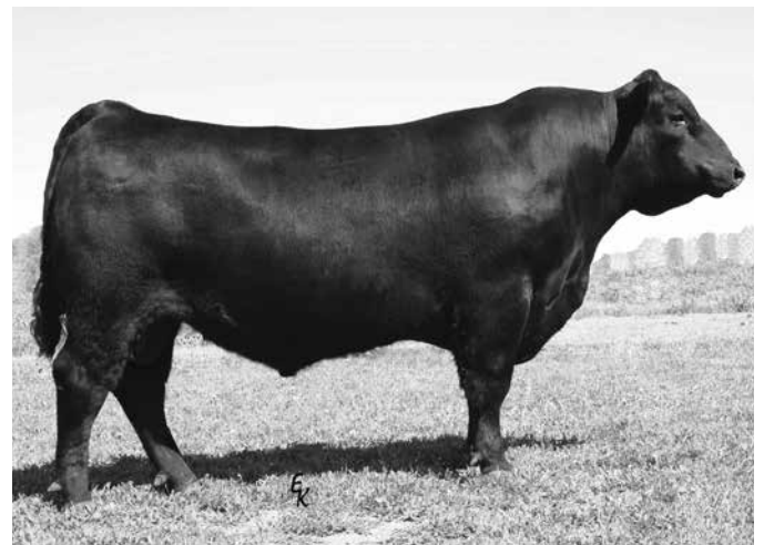
SITZ UPWARD 307R

Another female bred in the Kinsey's Oak Front herd in Flemington, WV. A daughter of the very popular Genex sire Sitz Upward 307R out of a dam from the Georgina cow family. Great EPD's on this young female. Vet checked to calve in June or July to the service of CKF GAR Objective 814 whose EPD's are +11 +.8 +48 +86 +24.